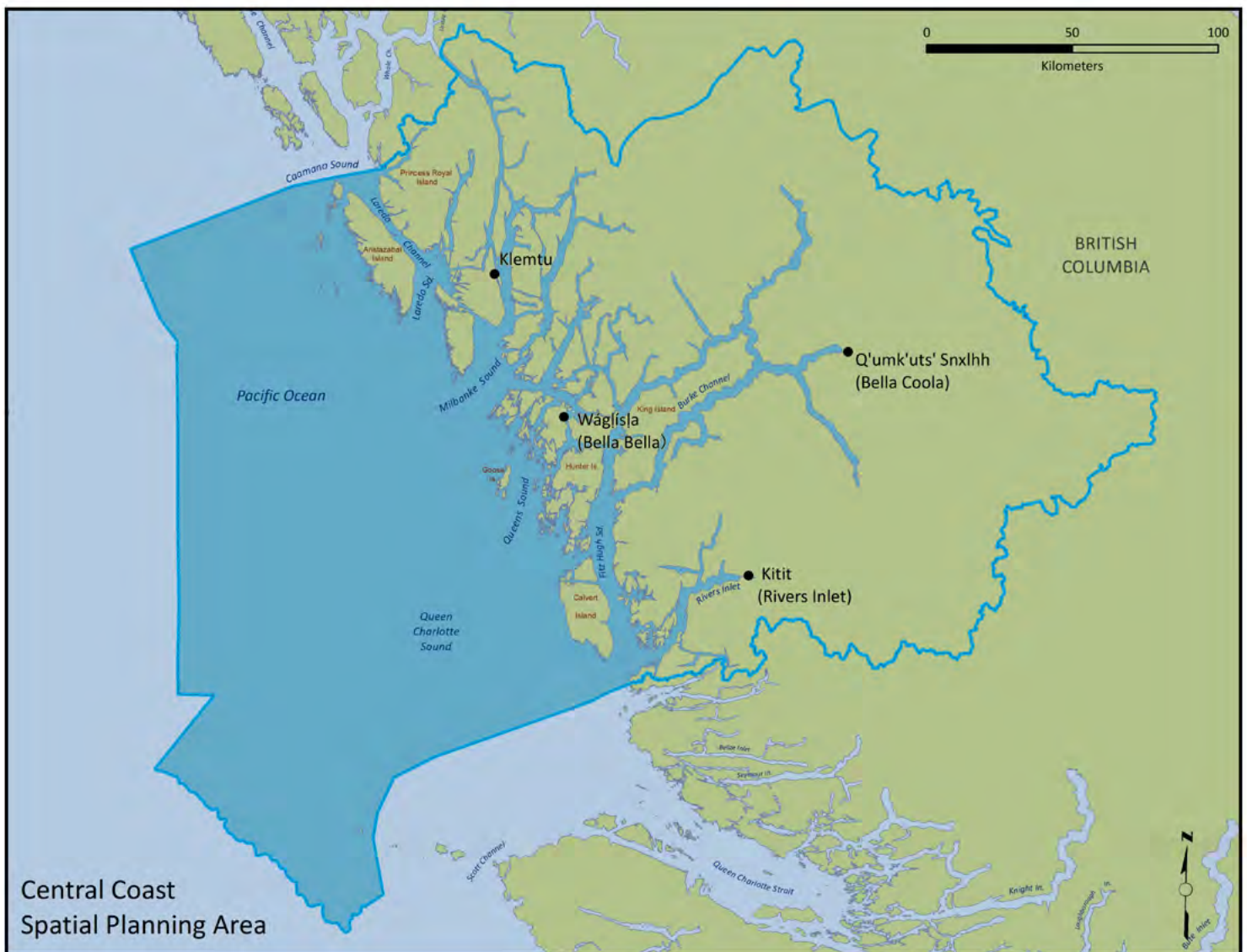
Figure 1: Map of the Central Coast including the current primary locations of the member Nations' communities.

Providing coordination, facilitation, and technical support for Heiltsuk, Kitasoo Xai'xais, Nuxalk, and Wuikinuxv in collectively upholding the laws of our ancestors in the governance and management of our waters and marine resources to achieve our vision.